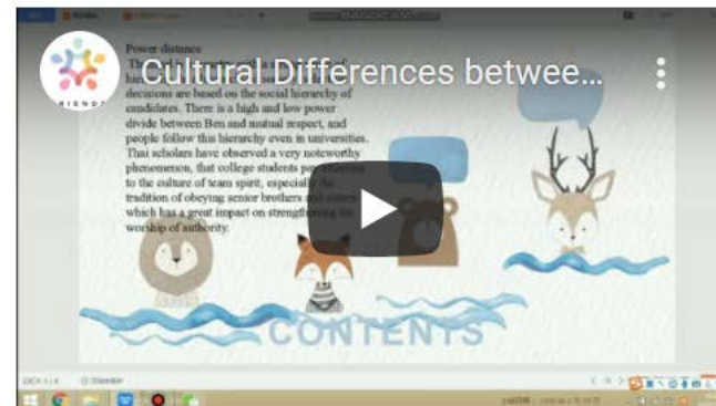
Cultural Differences between Thailand and China – Liu Xuan