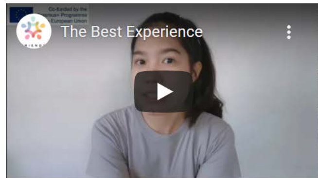
The Best Experience – Kitiyagon Pusod